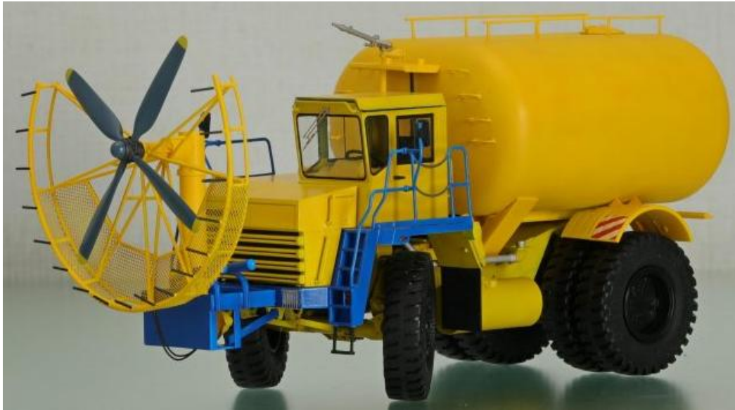
Figure 2. UMP-1 local ventilation unit.

In addition to the propeller, the unit is equipped with a drive mechanism, a water spraying system, a pump drive, and a control system.