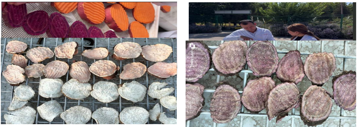
the sun and spreading in the drying apparatus

In our research, the residual moisture content of sweet potato dried under these two different conditions was analyzed. It was observed that the residual moisture levels varied depending on the drying conditions (Table 1).